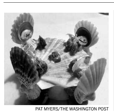
Poker game and shell game in

● THE STYLE CONVERSATIONAL The Empress's weekly online column, published late Thursday afternoon, discusses each new contest and set of results. Check it out at wapo.st/conv1252.